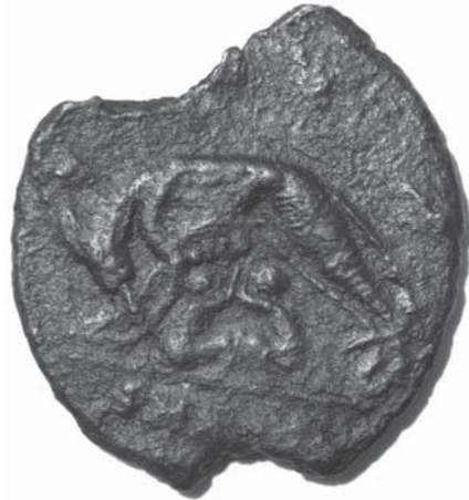
Ancient coin showing Romulus and Remus with the she-wolf.